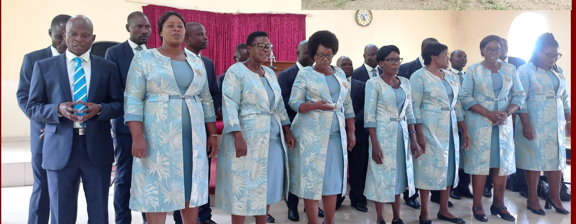
Faith for Today