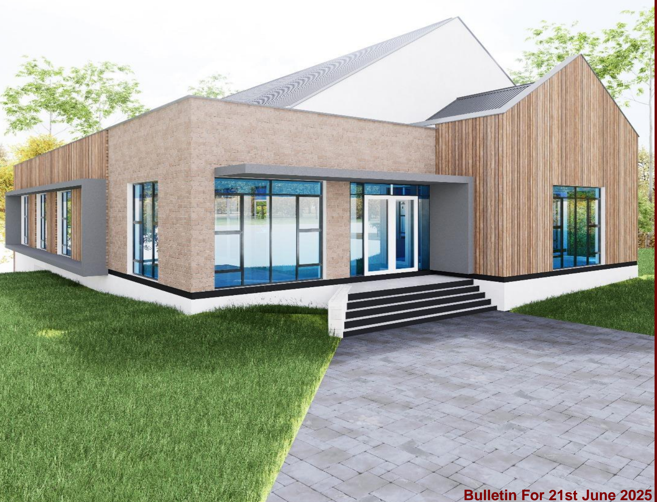
Bulletin For 21st June 2025