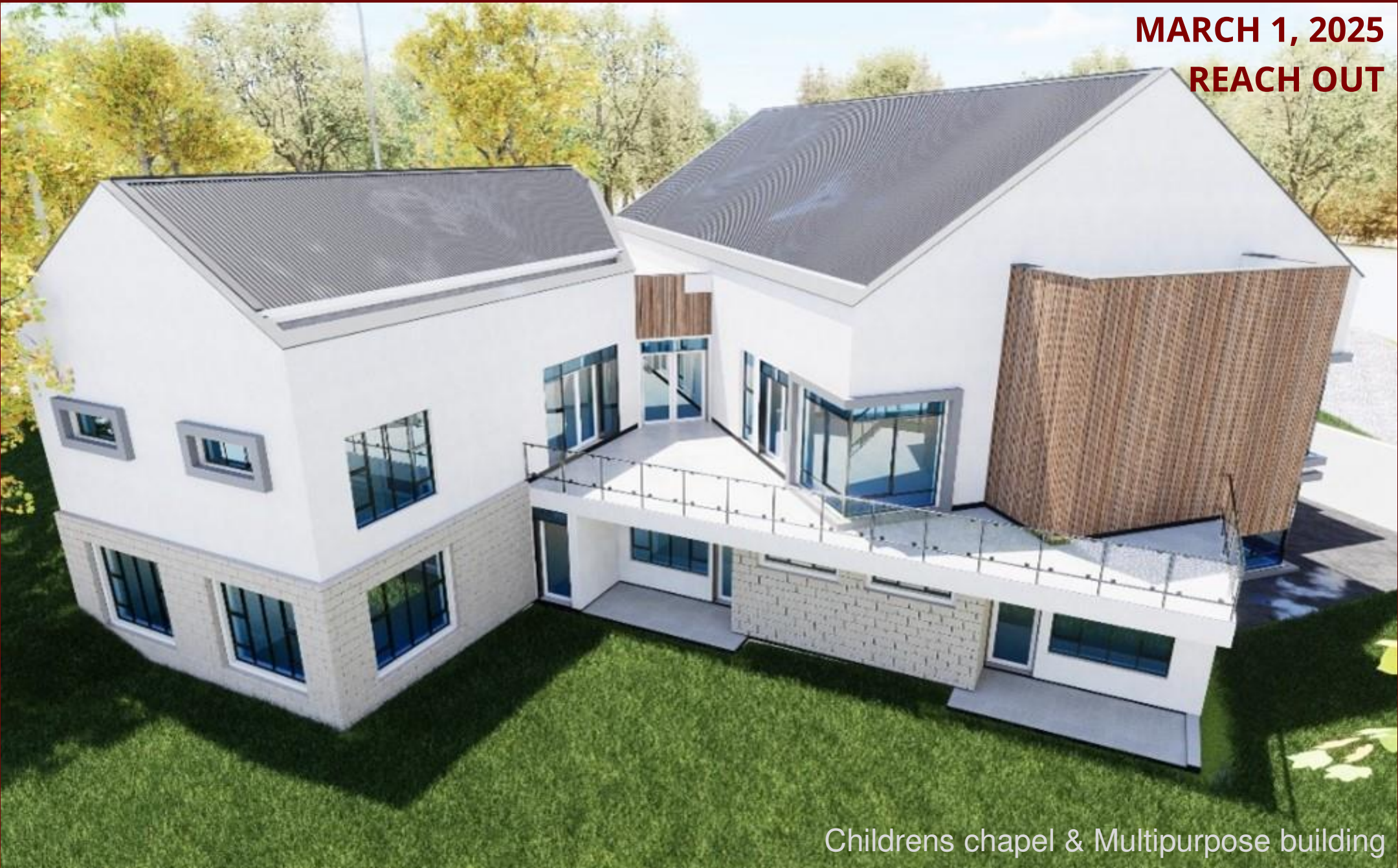
Childrens chapel & Multipurpose building