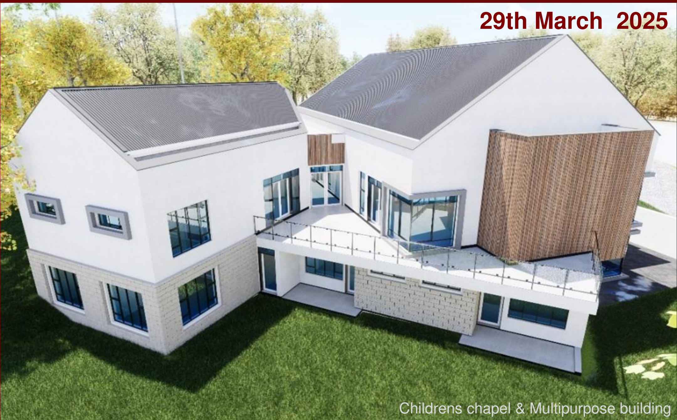
Childrens chapel & Multipurpose building