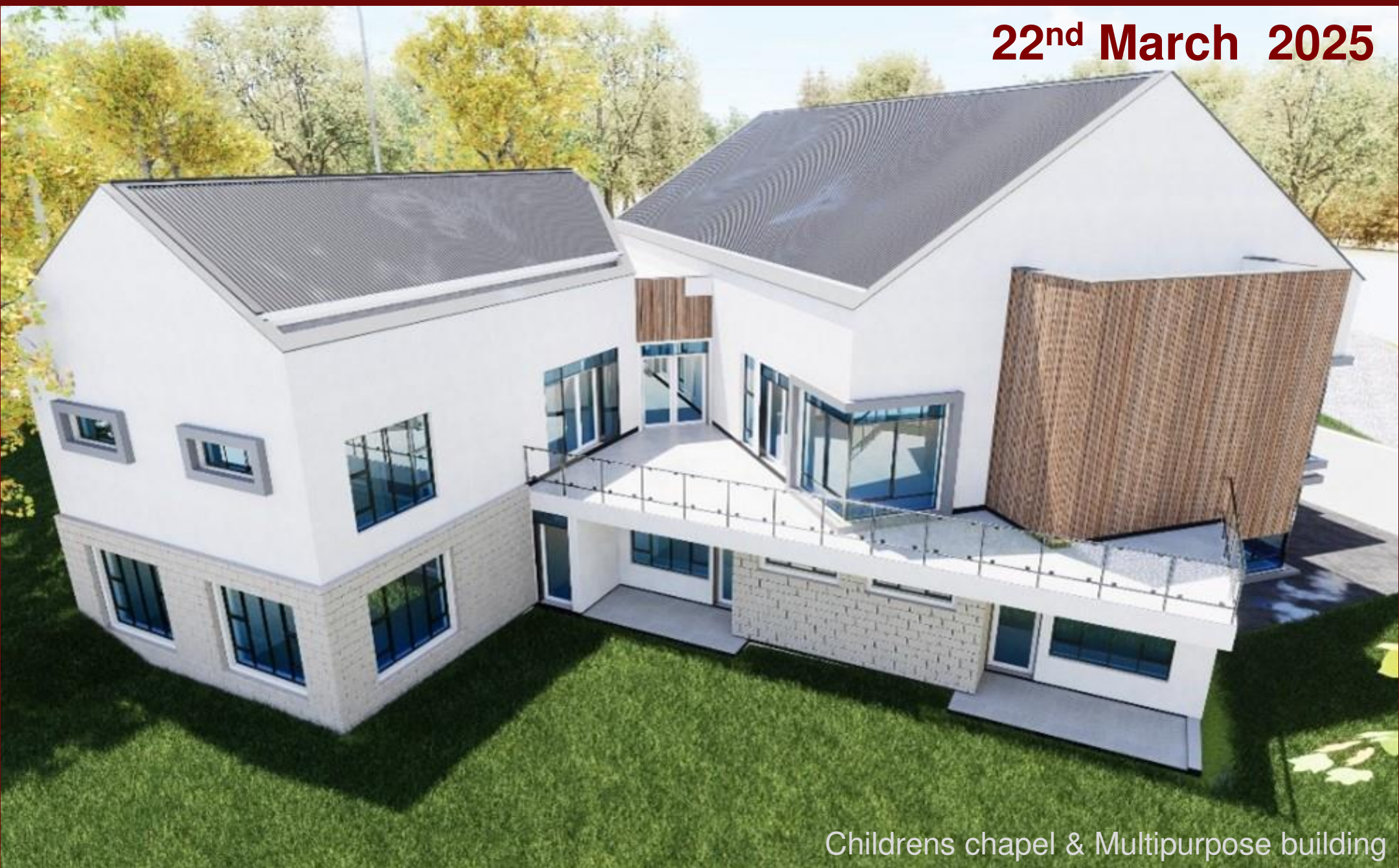
Childrens chapel & Multipurpose building