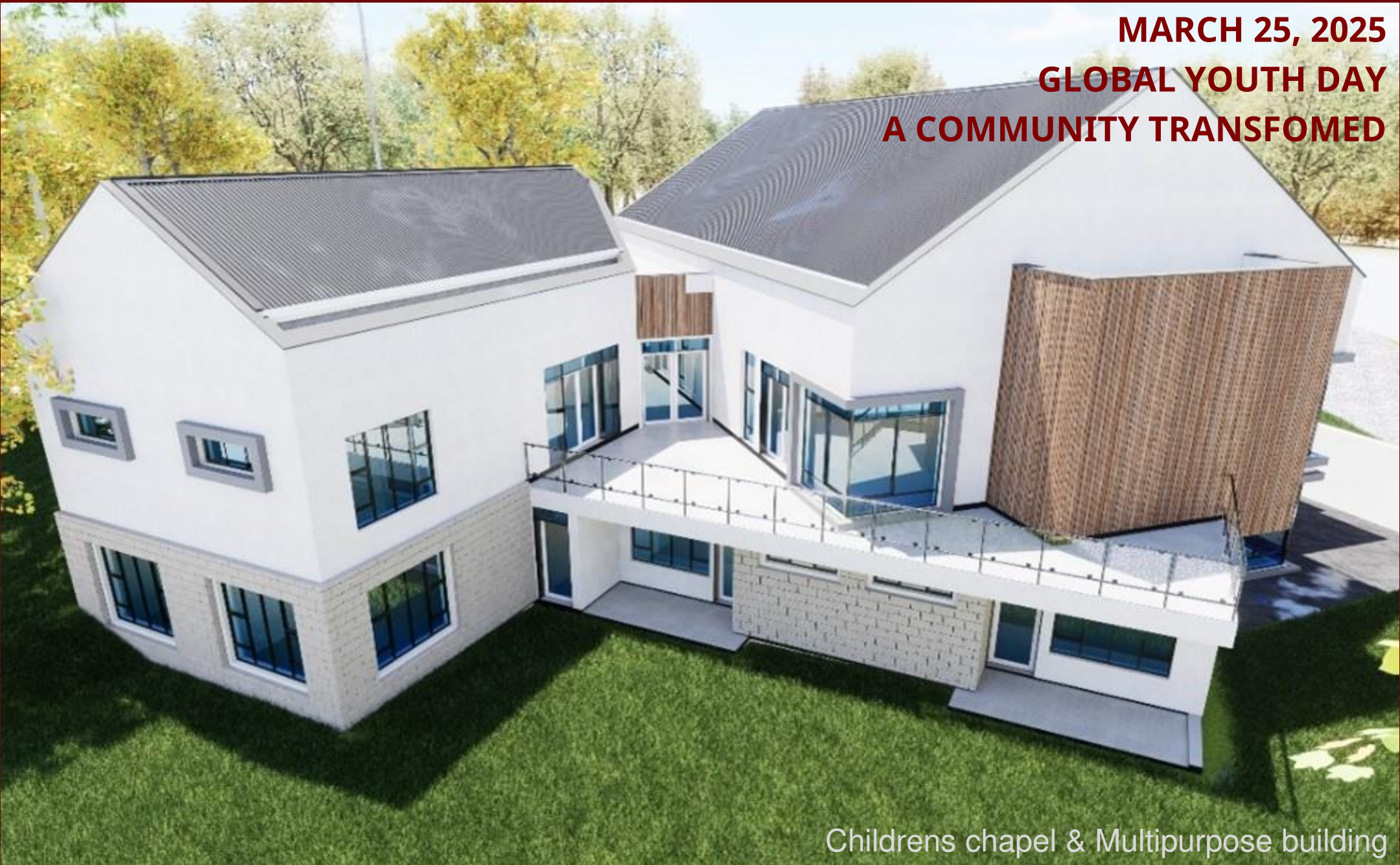
Childrens chapel & Multipurpose building

MARCH 25, 2025 GLOBAL YOUTH DAY A COMMUNITY TRANSFORMED